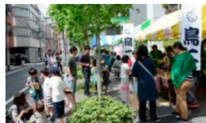
Child open space