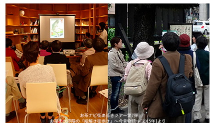
Ocha Navi walking tour